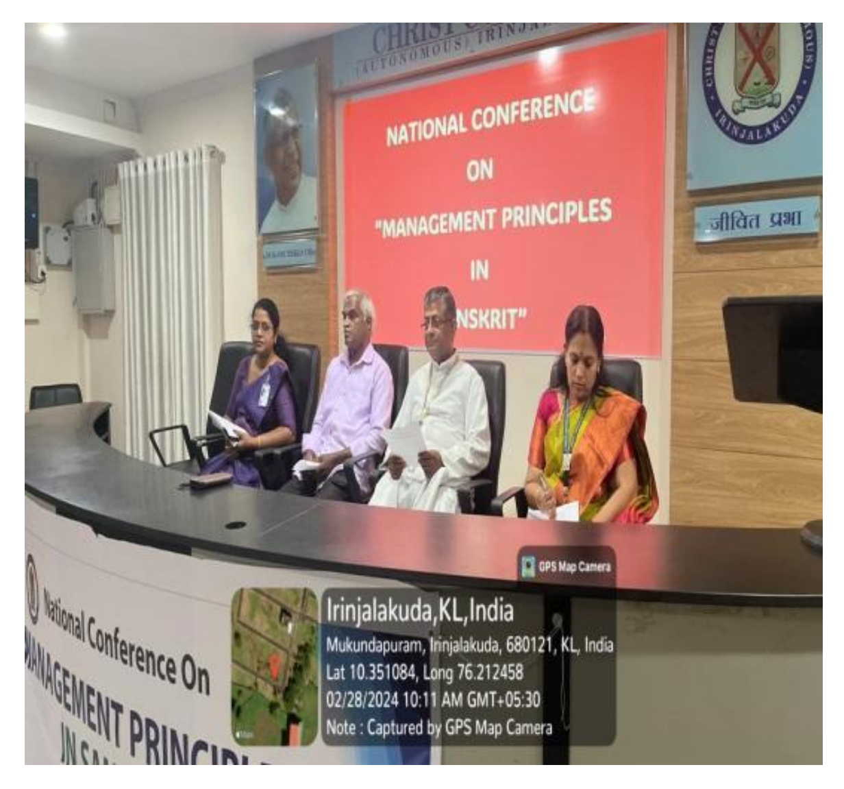
Outcomes of the Conference: Interdisciplinary Collaboration Recommendations were made for further interdisciplinary research linking Sanskrit studies with management sciences.

Post Graduate and Research Department of Commerce and Department of Sanskrit of Christ College Irinjalakkuda on 28th February 2024. The one-day national conference on Management Principles in Sanskrit focused on exploring the ancient Indian knowledge systems (IKS) and their relevance in contemporary management practices. Organized with the objective of bridging ancient wisdom with modern management theories, the conference brought together scholars, practitioners, and students.